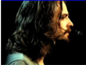
Minus The Bear 'Hold Me Down'