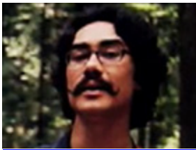
The Expendables 'Wells'